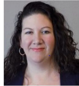
Margo Ebersole Rural Communities Resource Center